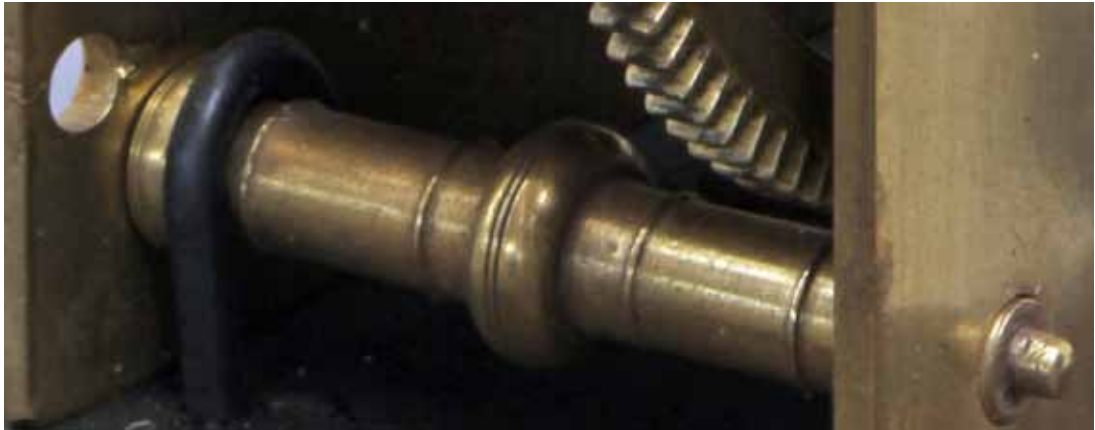
Fig. 8. The four finely fluted pillars with ringed knobs are screwed into the backplate – the pillar extensions on view from the back, are also ringed.