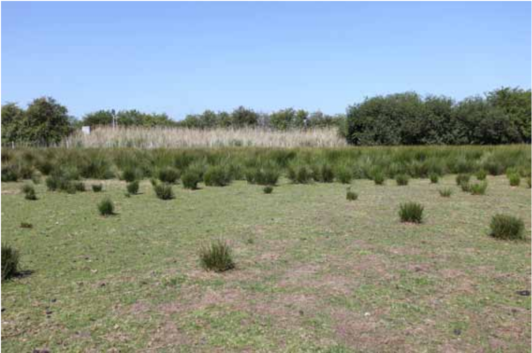
Fig. 4. Looking toward the Wrexham–Chester railway line which is obscured by the area of pale, tall reeds. Only half of the decoy has been visible from this direction since the construction of the line. The low lying area extends further to the left and right of this shot and the land slopes away gently from the camera. The outline of the decoy is visible from the air. We visited the site during a prolonged dry spell of weather; this land frequently floods after heavy rainfall.

unusual location description was made, the decoy was owned by James Mainwaring. A decoy could be a significant business, 16 and perhaps he commissioned Thomas Hampson to make the clock for the coy man's house?