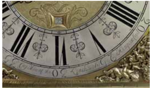
Fig. 3. The signature on the chapter ring reads: 'Coy Man of the Leach Tho Hampson fecit'.