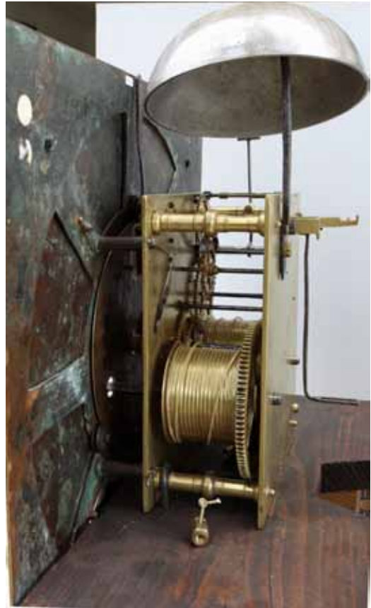
Fig. 7. The movement from the going side showing the cartwheel style of dial.

Unlike the majority of his clocks made whilst he was in Wrexham, this clock was not numbered by Thomas Hampson. It is not known whether Chester-made longcase clocks like the one illustrated in the Miller's Guide, or the one auctioned at Sotheby's, were numbered. In neither case was numbering mentioned in the items' descriptions. Linnard has listed the numbers which have been traced; the lowest, and presumably the earliest, is number nine; it was made in Wrexham. 20 If the Chester-made clocks were included in the numbering system