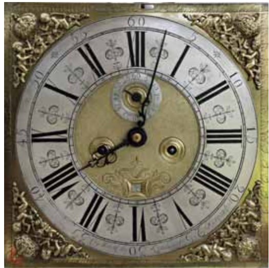
Fig. 1. The 12¾ inch dial is finely matted, has ringed winding holes and well balanced engraving around the date aperture. It is bordered with leaf motifs rather than the more usual wheatear engraving. The chapter ring is beautifully engraved with ebullient half hour markers and only two starburst half quarters, (owing to the length of the signature).

Linnard estimated that as many as 1600 clocks were made in the Hampson workshop during his thirty-five year working life, but of