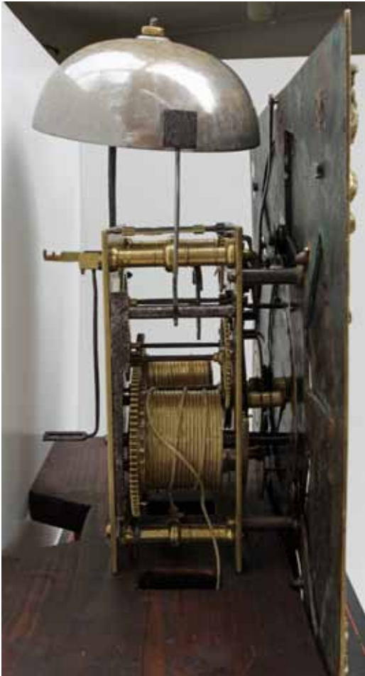
Fig. 6. The movement from the strike side showing the strike/silent lever reaching up to the top of the dial.

Unlike the majority of his clocks made whilst he was in Wrexham, this clock was not numbered by Thomas Hampson. It is not known whether Chester-made longcase clocks like the one illustrated in the Miller's Guide, or the one auctioned at Sotheby's, were numbered. In neither case was numbering mentioned in the items' descriptions. Linnard has listed the numbers which have been traced; the lowest, and presumably the earliest, is number nine; it was made in Wrexham. 20 If the Chester-made clocks were included in the numbering system