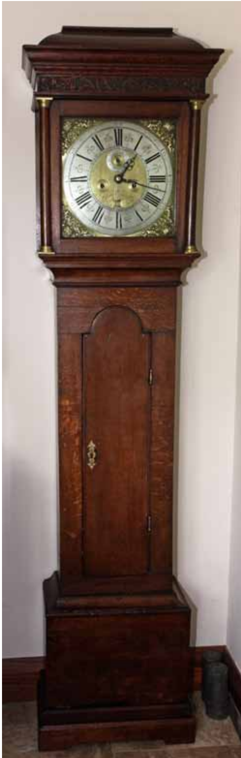
Fig. 2 (left). The 'Coy Man' clock. Oak longcase clock by Thomas Hampson, circa 1720. The short oak case (79 inches) is not thought to be original as the 12 inch mask struggles to display the 12¾ inch dial. In other respects, the case is contemporary.