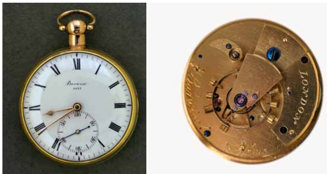
Fig. 8. Dial and back plate of a gold pocket chronometer signed Barwise London N o 5445. Back plate diameter 44.0 mm. Balance diameter 19.0 mm. Case diameter 54.8 mm. Total weight 151 g. Case maker T.H. Hallmark for London 1812. Private collection.

Robert Pennington Camberwell 17 April 1836 , evidently restored and signed by Robert Pennington Jr. 43 Over the years 1800–1825 about 25 per cent of the 5000 watches retailed by Barwise were pocket chronometers. 44