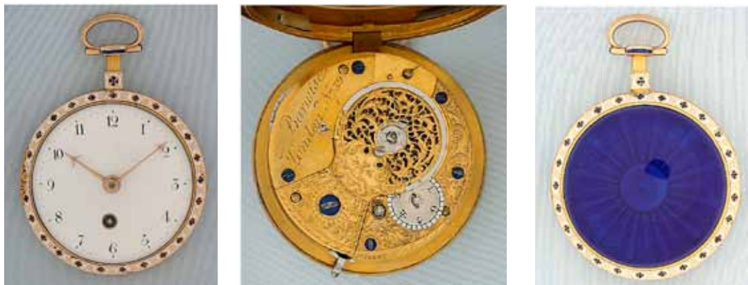
Fig. 7. Verge watch signed on the backplate Barwise London N o . 739. The watch is by courtesy of Don Levison and the photographs by courtesy of www.bogoff.com .