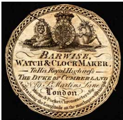
Fig. 3. Barwise watch paper from about 1805.

Brockbank, Grant, Grimaldi, Hardy, Haley, Molyneux, Nicholson, Pennington, Petto, Recordon, Robinson, Troughton, and Young. 24 The Barwise watch-paper shown in Fig. 3, with its stress on chronometers and longitude, may date from this period. The royal arms appear on the watch-paper because the Duke of Cumberland was the fifth son of H. M. George III, the reigning king.