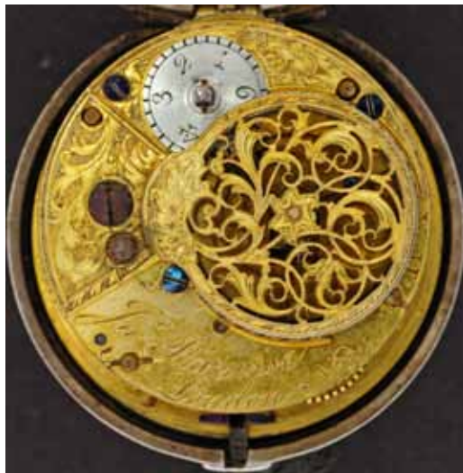
Fig. 5. Verge watch signed on the dial John Foster and on the backplate Jn° Barwise London N°. 37 .

The great Redan was next visited. Such a scene of wreck and ruin! - all the houses behind it a mass of broken stones - a clock-turret, with shot right through the clock - a pagoda in ruins - another clock-tower, with all the clocks destroyed save the dial, with the words "Barwise, London," thereon.... 39